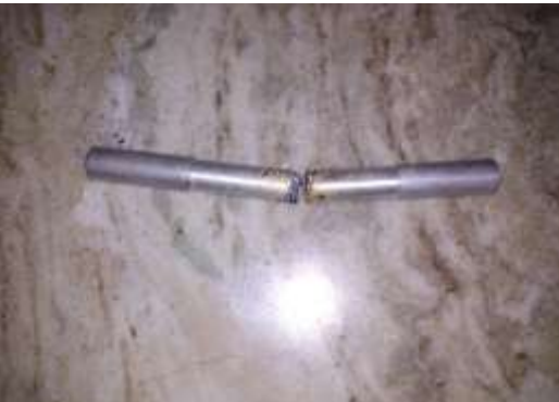
Fig No.3 Deformed Work piece